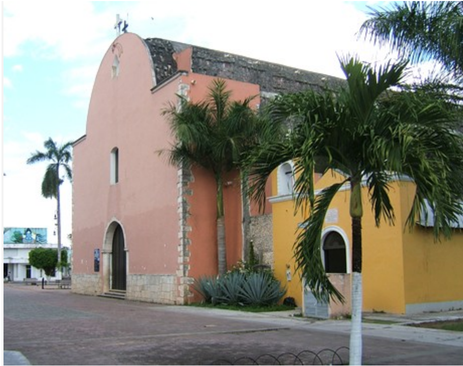
Balam Nah, the original sanctuary of the Speaking Cross today. The smaller yellow building is the replacement built after 1915. Felipe Carrillo Puerto, Quintana Roo.

The year 1915 is another date that one could cite as an end of the war. The Mexican Revolution had sent Díaz into exile, relieved General Bravo of command, and ended his private empire. The Revolution came to Yucatán in the person of General Salvador Alvarado, Governor and Military Commander of Yucatán and Quintana Roo, who made sweeping changes. He introduced reforms that addressed Maya grievances. Prisoners were released, and most of the troops departed. He offered a peace treaty, and after some Maya groups signed it, he ordered all non-Maya people to leave Santa Cruz and moved the territorial capital to Payo Obispo.