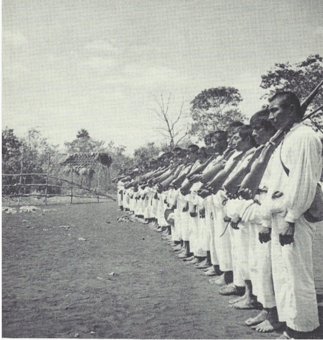
The guard at Xcacal Guardia, 1930s

Central Quintana Roo has been transformed in the past half-century, as roads, schools, and modernization penetrated remote areas and people became increasingly dependent on a government once considered their enemy. But the Caste War remains immediate historical reality in tales told with pride and horror. Distinct Maya culture and ideology endure. Maya officers and priests continue to exercise authority in villages far from the beach resorts, far even from the language of the conquistadors.